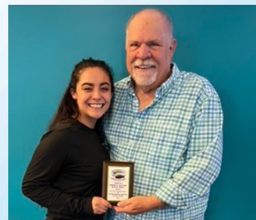
Doesn't Matter Grill