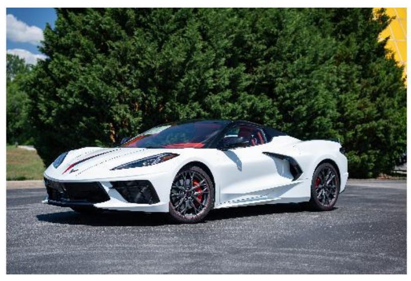
2023 Arctic White Corvette Convertible VIN #0001 9/2/2022

Price: $300.00 Tickets: 2023 Available: 982