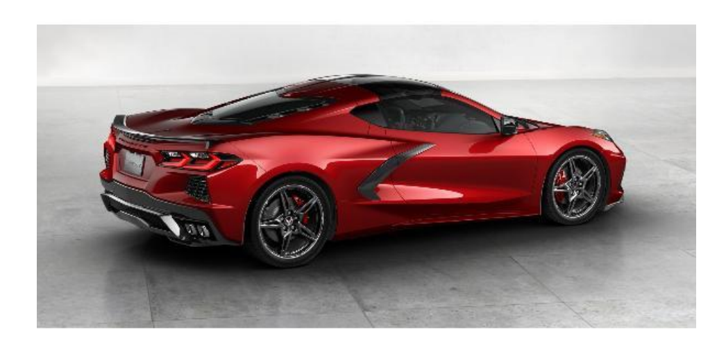
2023 Red Mist Corvette Coupe 9/3/2022