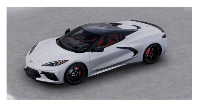
2022 Arctic White Corvette Convertible 4/30/2022